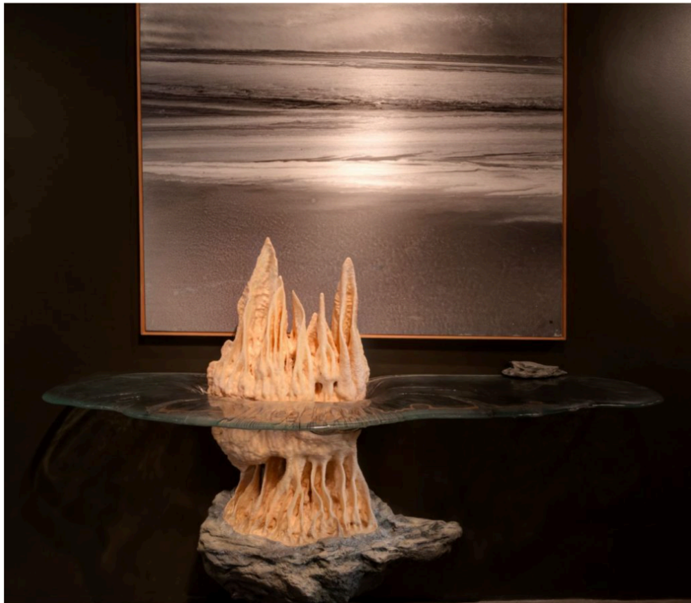
STUDIO GREYTAK STALACTITE IMPACT CONSOLE