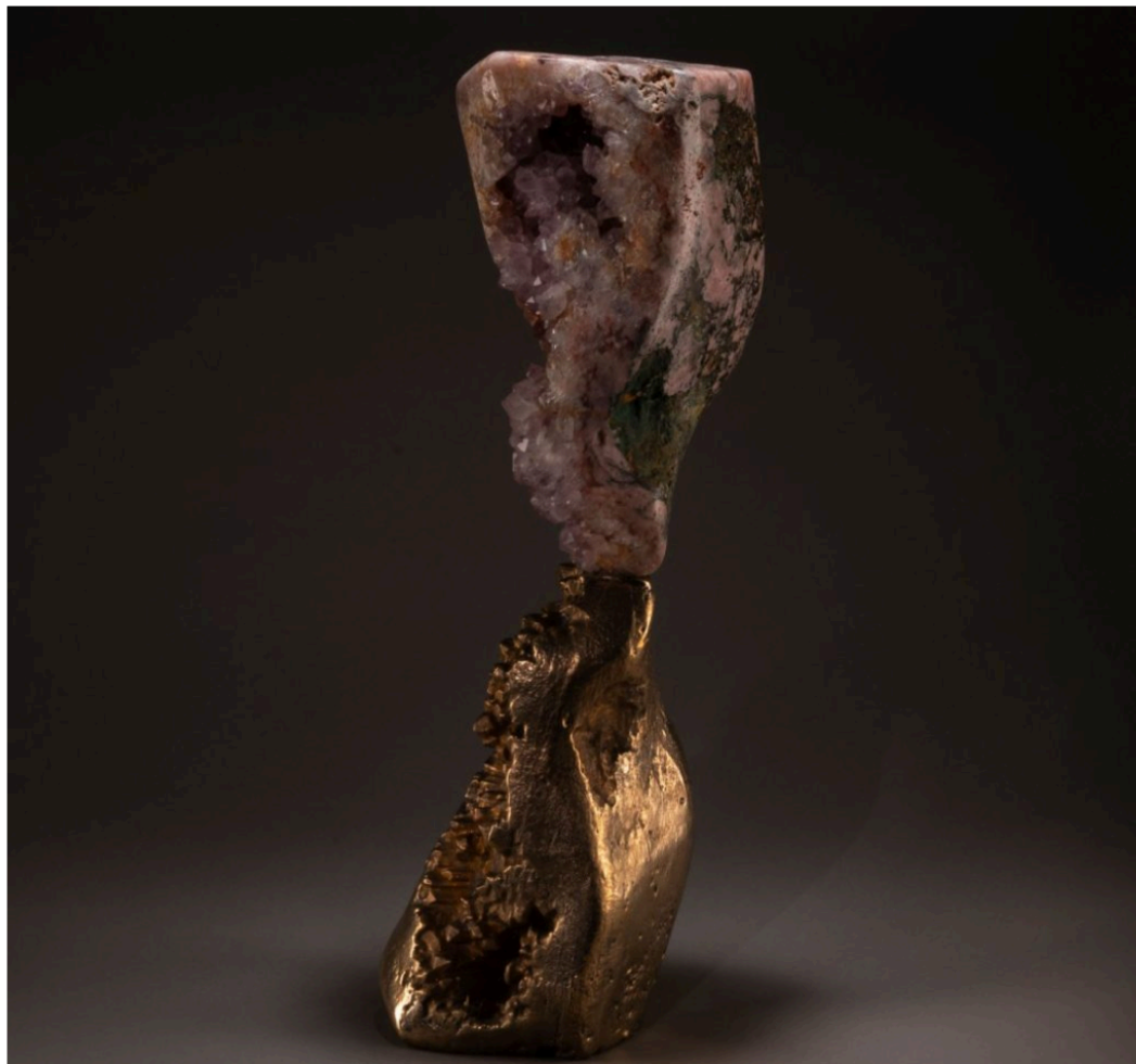
STUDIO GREYTAK: MIRROR LAKE