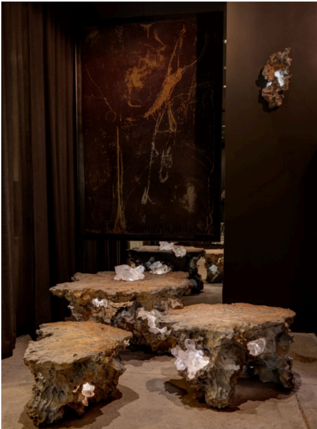
STUDIO GREYTAK: EROSION LUMINAIRE TABLES

If you would like to explore these universal forces you can schedule a tour with Guy Regal NYC at the New York Design Center.