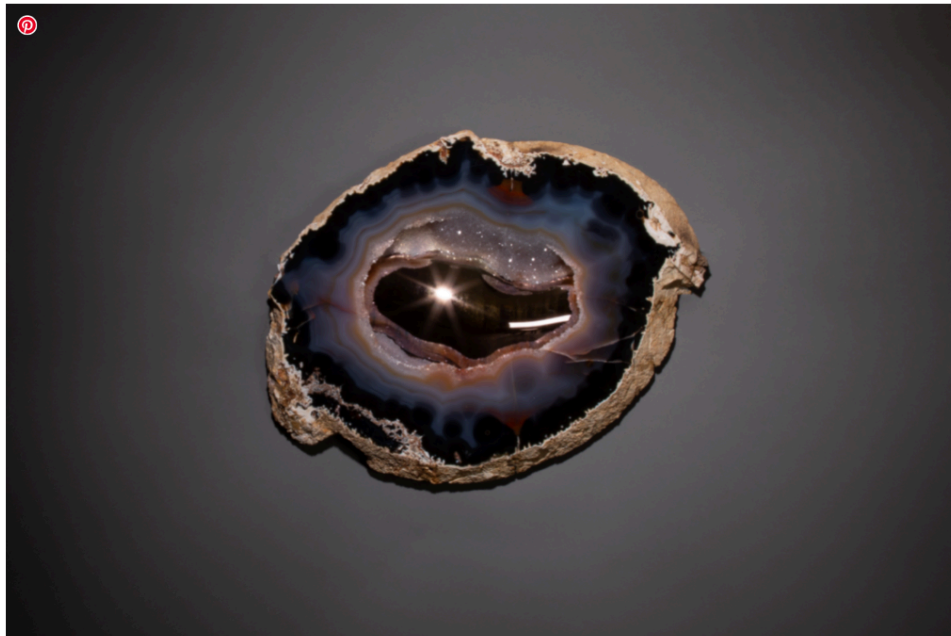
STUDIO GREYTAK: LAVA MIRROR

Many of the pieces, though designed for spaces here on Earth, can very easily be imagined to be comfortably at home on a stardeck of the not too distant future as pioneers such as Jeff Bezos and Sir Richard Branson, shoot for the stars in a very real way. One would not be surprised to find some of the one-of-a-kind pieces to be gracing a few of their moon based offices.