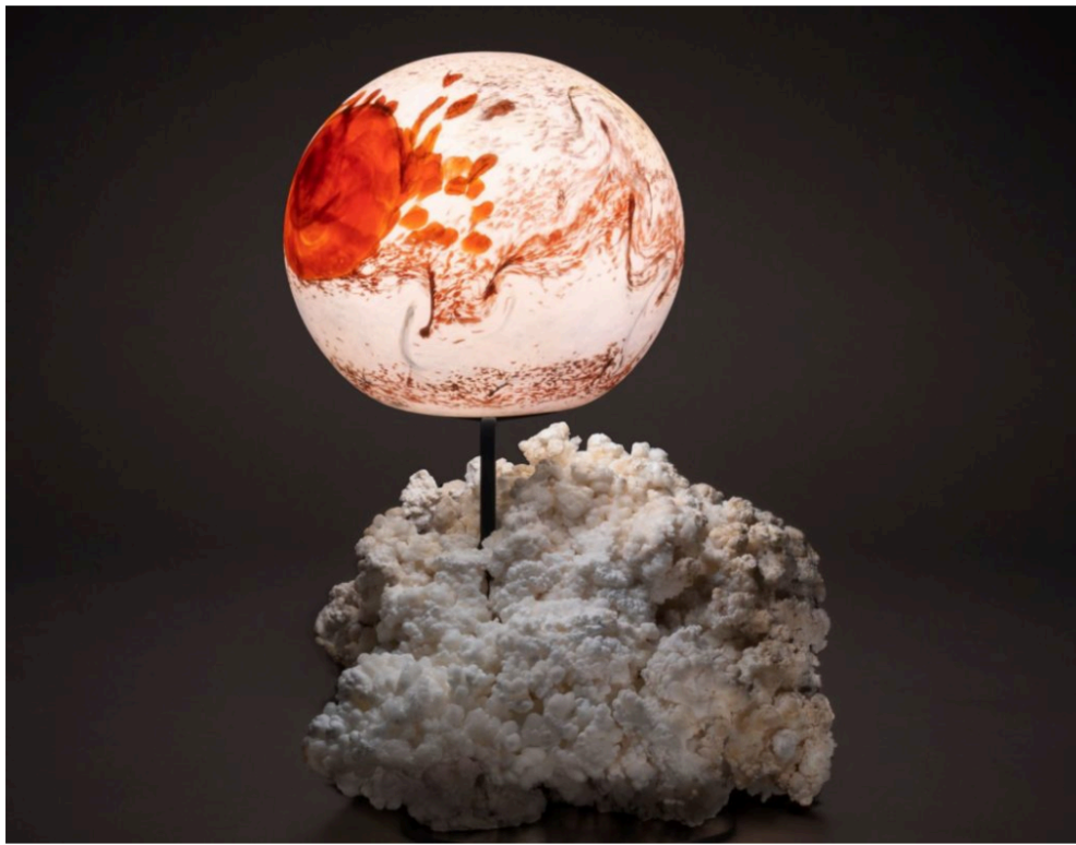
STUDIO GREYTAK – JUPITER