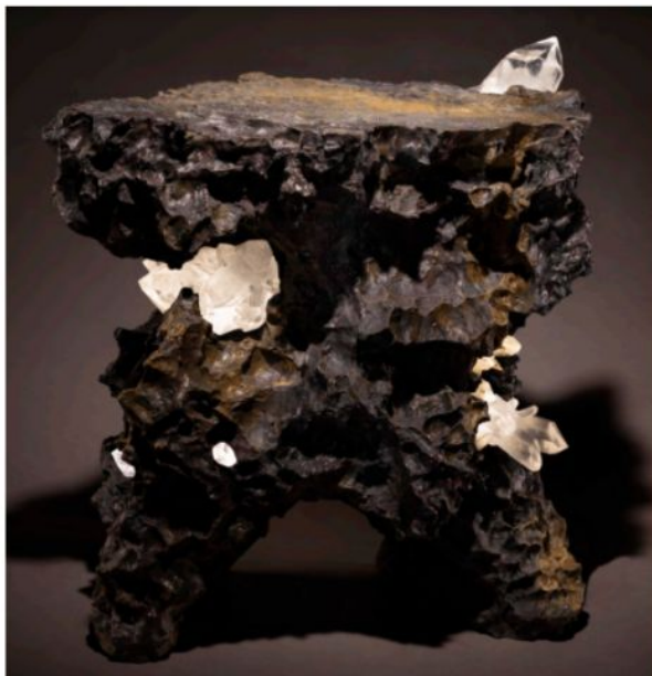
Studio Greytak Universe Collection.

The collection, which explores the intersection of natural and man-made design, was created by Studio Greytak, an art project based on the ideas of John Greytak. The collection is inspired by the "story of many worlds" such as Earth, sky, space and sea. The works will be placed in a specially lit room, immersing the viewer in a space where the walls simulate the Montana mountains at various times of the day, from sunrise to sunset.