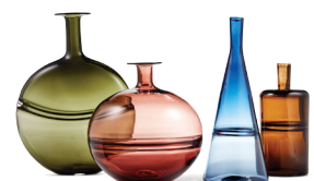
LOUNGE-CULTURE REDUX Reflection bottles, $125 each; garybodker.com.