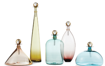
THE NEW BOHEMIA Original Jewel bottles, $350 each; vetrovero.com.