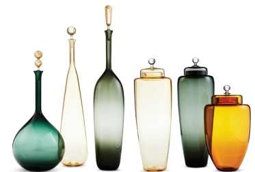
EARTH, WIND, AND FIRE Grappa bottles and Ginger jars, $650 each; joecariati.com.

...and their colored-glass collections are all grown up, showing off highly nuanced shades and sculptural verve.