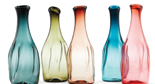
SPACE-AGE SOPHISTICATE Raisen bottle minis, $95 each; orbixhotglass.com.