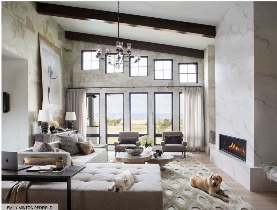
EMILY MINTON REDFIELD

When you have an unobstructed view of the Rocky Mountains as your backdrop, basic goes out the window. For Houston-based designer Lucinda Loya, this space (don't call it a living room—it's so much more than that) was all about taking inspiration from the natural landscape to foster a welcoming environment full of texture, warmth, and soothing neutrals. A gallery of art and stunning brass stalactite-esque pendants greet guests as they come in, and a floor-to-ceiling fireplace offers bench seating for extra friends (or pets) to perch. An oversize sectional with an extended backless chaise (Loya has one just like it in her own house), covered in a no-nonsense performance fabric, supplies the perfect spot for working from home, lounging with family, or watching the sunset.